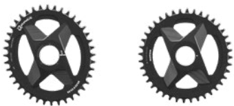
1X Direct Mount